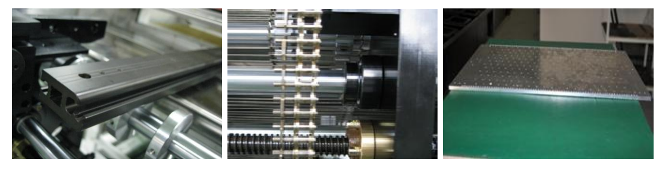
2. Chamber and high temperature structure parts

1. Transportation system and rectifying plate structure